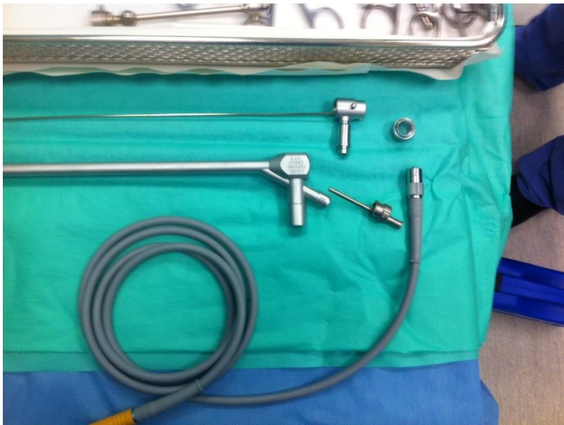
The relevant bits