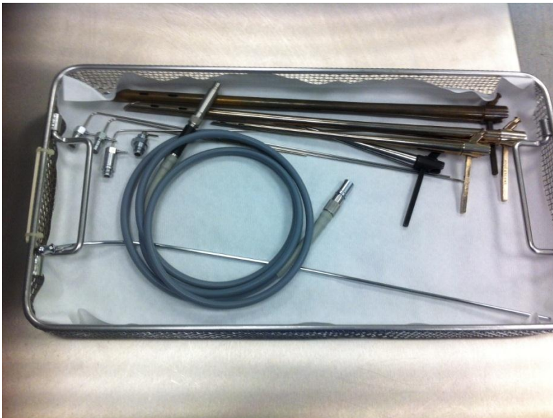
The device as it is presented in the tray