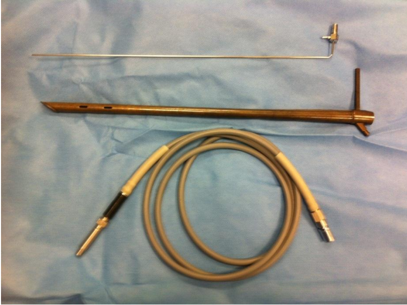
The relevant bits