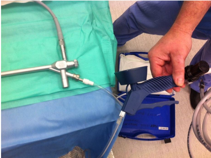
The device assembled and connected to a Manujet

But, I hear you say, the classic use for the bronchoscope is removal of an inhaled foreign body.