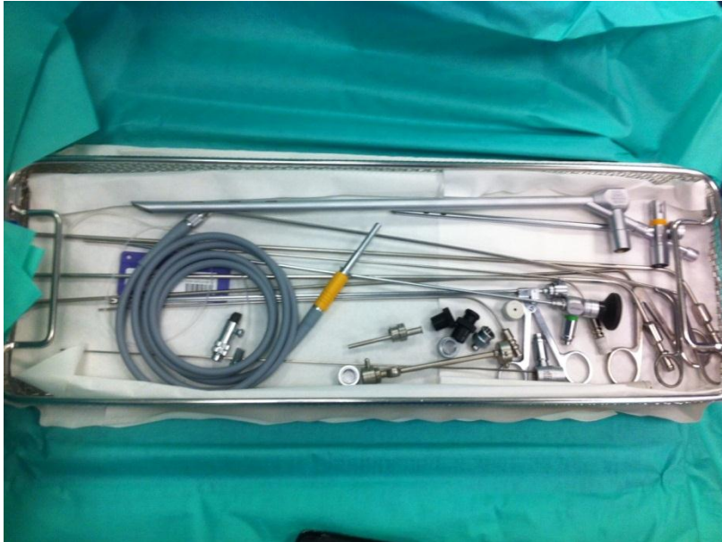
The device as it is presented in the tray